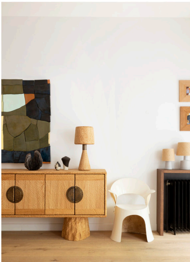
"Dunes" at Galerie JAG.