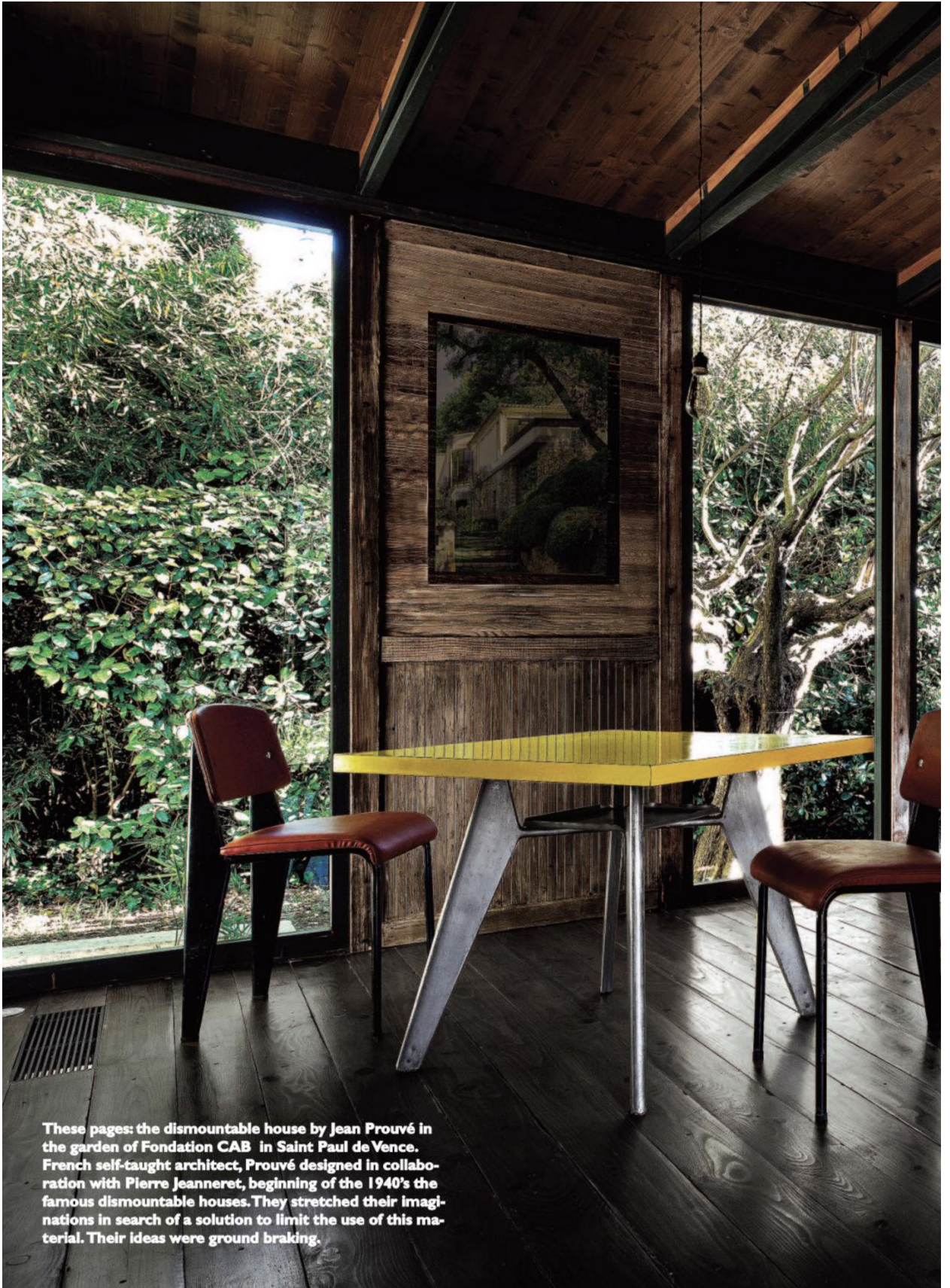
These pages: the dismountable house by Jean Prouvé in the garden of Fondation CAB in Saint Paul de Vence. French self-taught architect, Prouvé designed in collaboration with Pierre Jeanneret, beginning of the 1940's the famous dismountable houses. They stretched their imaginations in search of a solution to limit the use of this material. Their ideas were ground breaking.