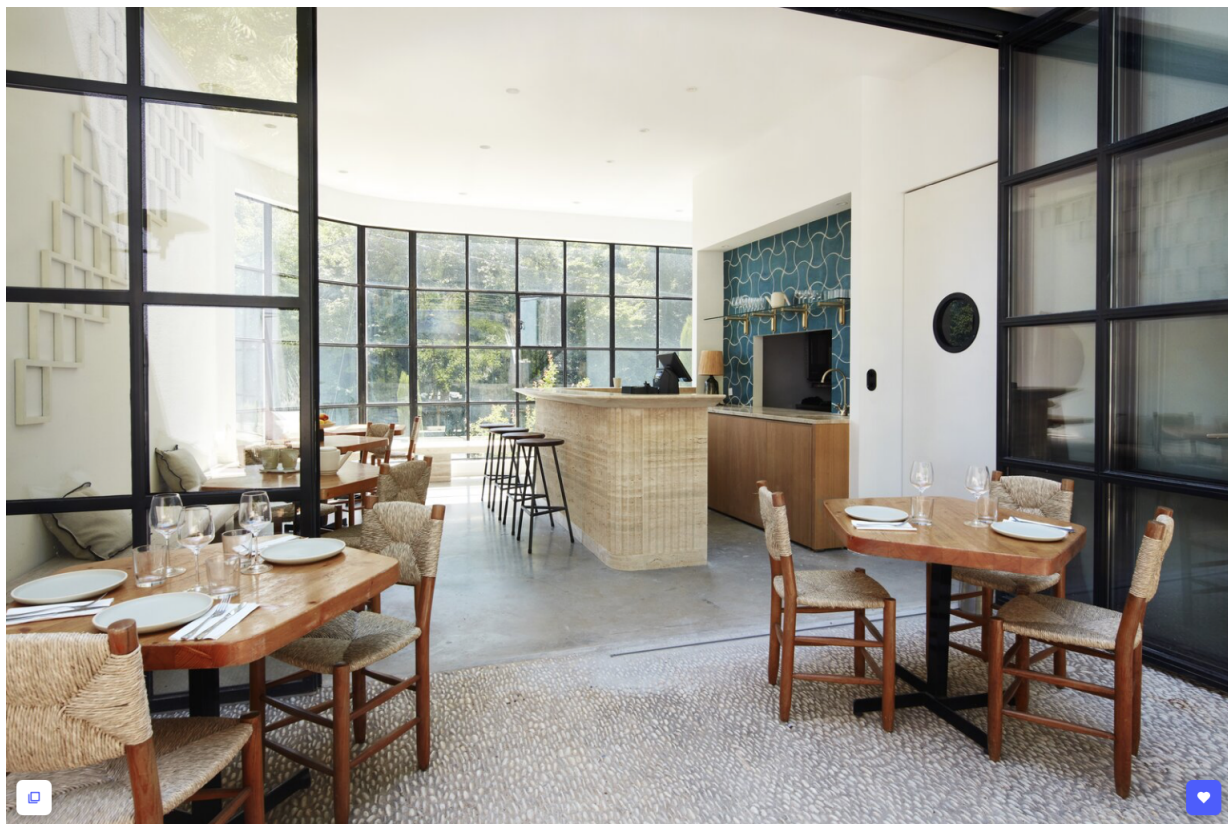
Guests can enjoy meals at the on-site restaurant—also designed by Zana—which boasts floor-to-ceiling glazing and outdoor seating.