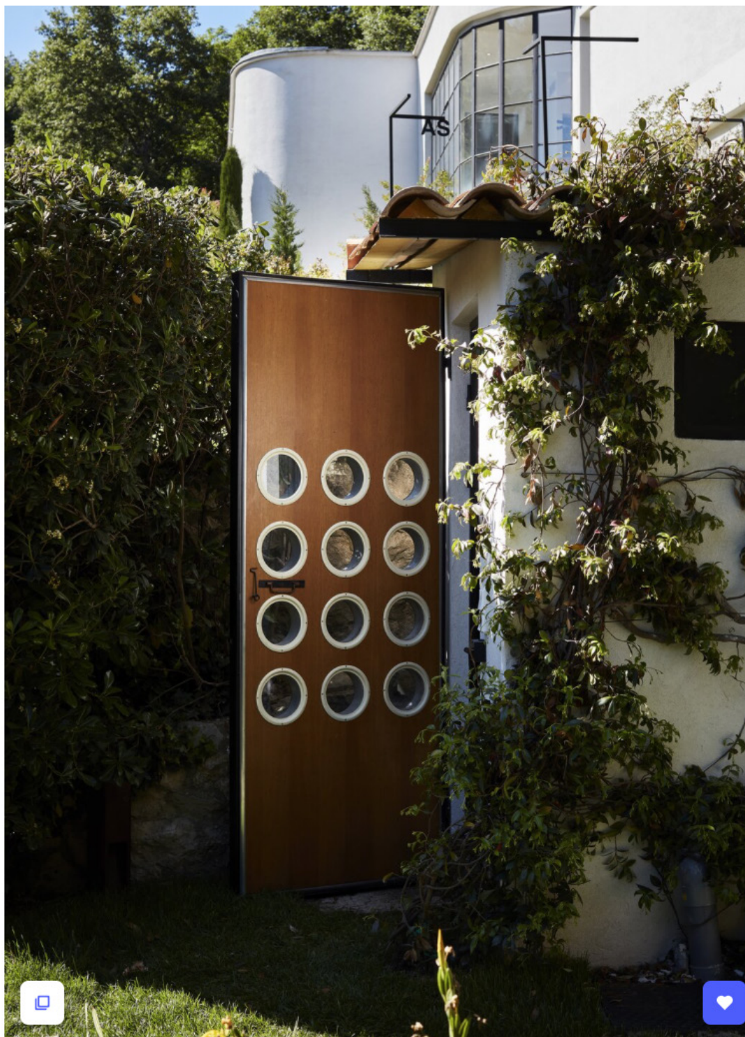
The demountable prefab home, originally designed by Prouvé in 1944, has been adapted into a guest bedroom with a newly attached bathroom created by French architect and designer Charle Zana.