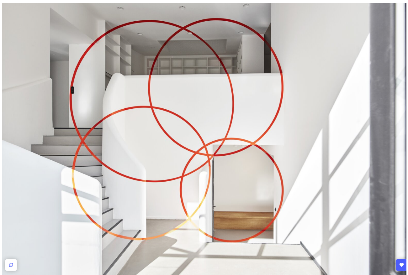
A vibrant installation by Swiss artist Felice Varini comprised of four interlocking orange circles welcomes guests at the main entrance.