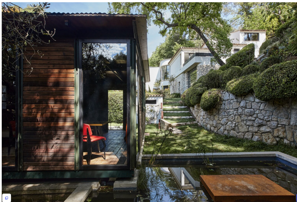
The Jean Prouvé–designed prefab is tucked away in the backyard between two koi ponds.

In addition to the guest suites located in the gallery's main building, visitors also have the option to stay in the historic Maison Démontable 6×6 prefab, which was designed by French modernist Jean Prouvé in 1994. The demountable home has been adapted into a guest bedroom complete with a newly attached bathroom designed by Zana. Nestled between two koi ponds in the gallery's backyard garden, the carefully restored wood-clad structure offers striking views of the Cap d'Antibes peninsula.