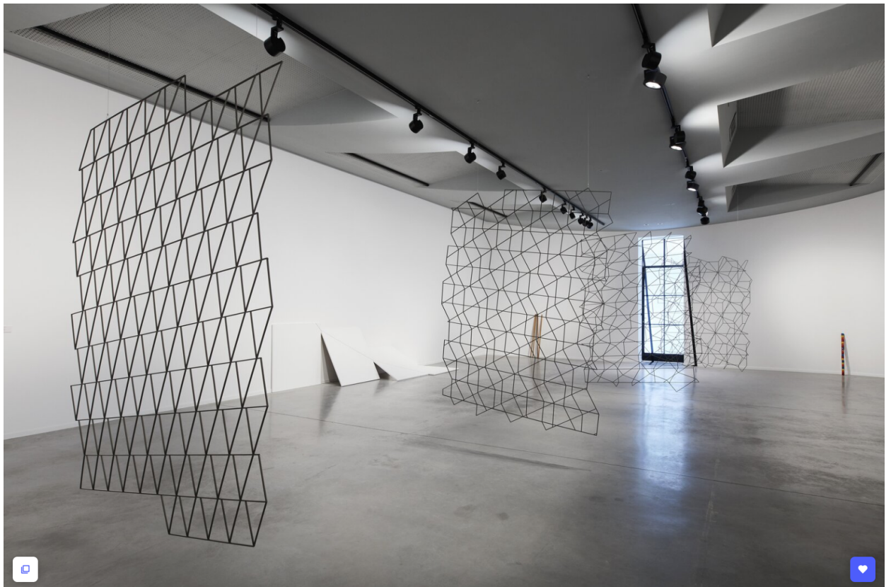
Much of the works on display are from Fondation CAB founder Hubert Bonnet's own collection. The contemporary art gallery also features rotating exhibitions.