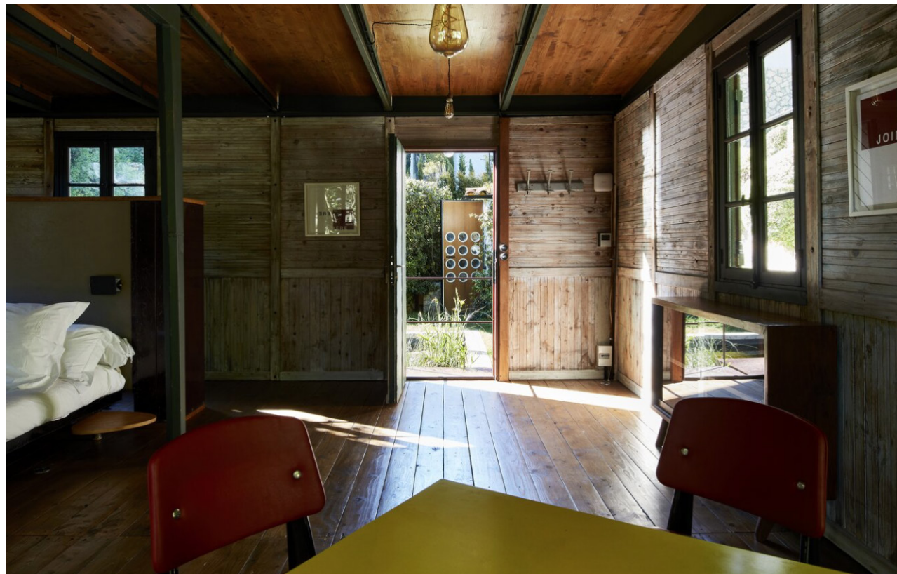
The small yet cozy structure, dubbed Maison D montable 6X6, features a kitchenette and dining area in addition to a bed and attached bathroom.

While the main building's four guest suites start from approximately $295 per night, an overnight stay in the Prouv -designed prefab will cost you around $940. Day visitors are also welcome to stop by and explore the gallery grounds. Works from Bonnet's personal collection—including art by Carl Andre, Michelangelo Pistoletto, Donald Judd, and Dan Flavin—are on display in the gallery spaces, which also showcase rotating exhibitions.