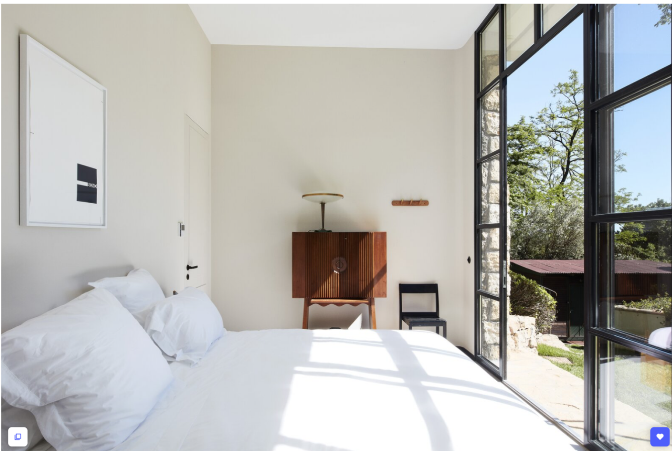
In the main building, the four guest suites are decorated with 20th-century furnishings including a Charlotte Perriand table, Jean Prouvé chairs, an Alvar Aalto lamp, and Le Corbusier headboards.

To learn more about the Fondation CAB Saint-Paul-de-Vence or book your own stay in a guest suite, please visit the organization's official website .